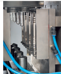
5. Preforms enter the open custom-designed molds.