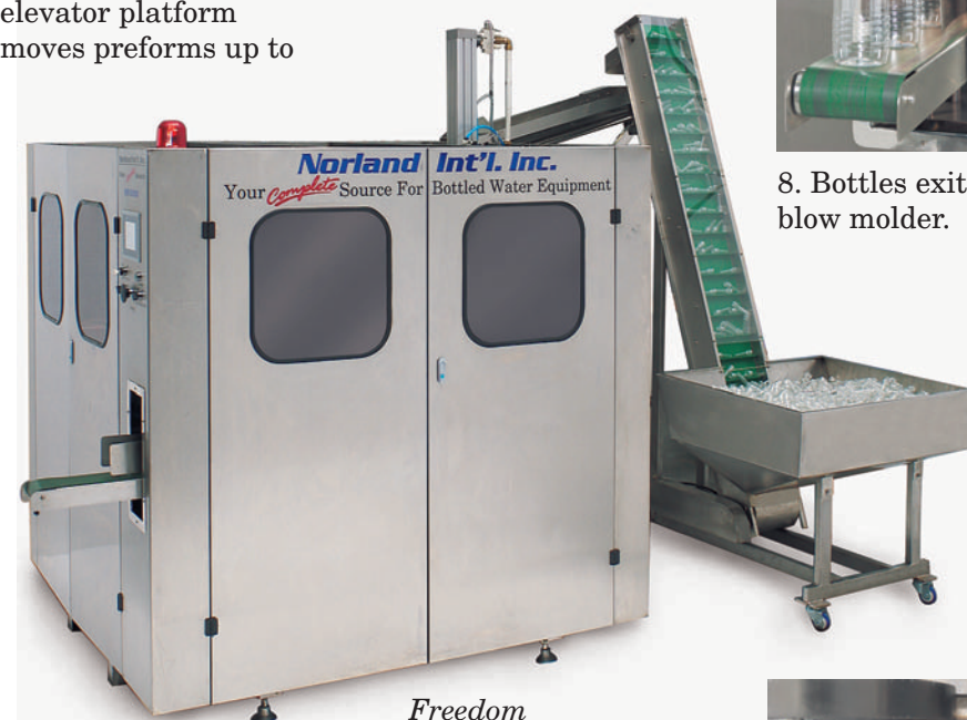
Freedom Series Model 3000