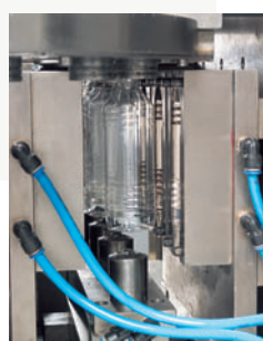
6. Finished bottles in the molds.