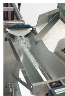
2. Automatic sorter separates, orients and loads preforms into gravity-fed preform chute.