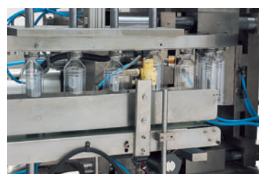
7. Bottles move out of the molds and onto a conveyor, which takes them out of the blow