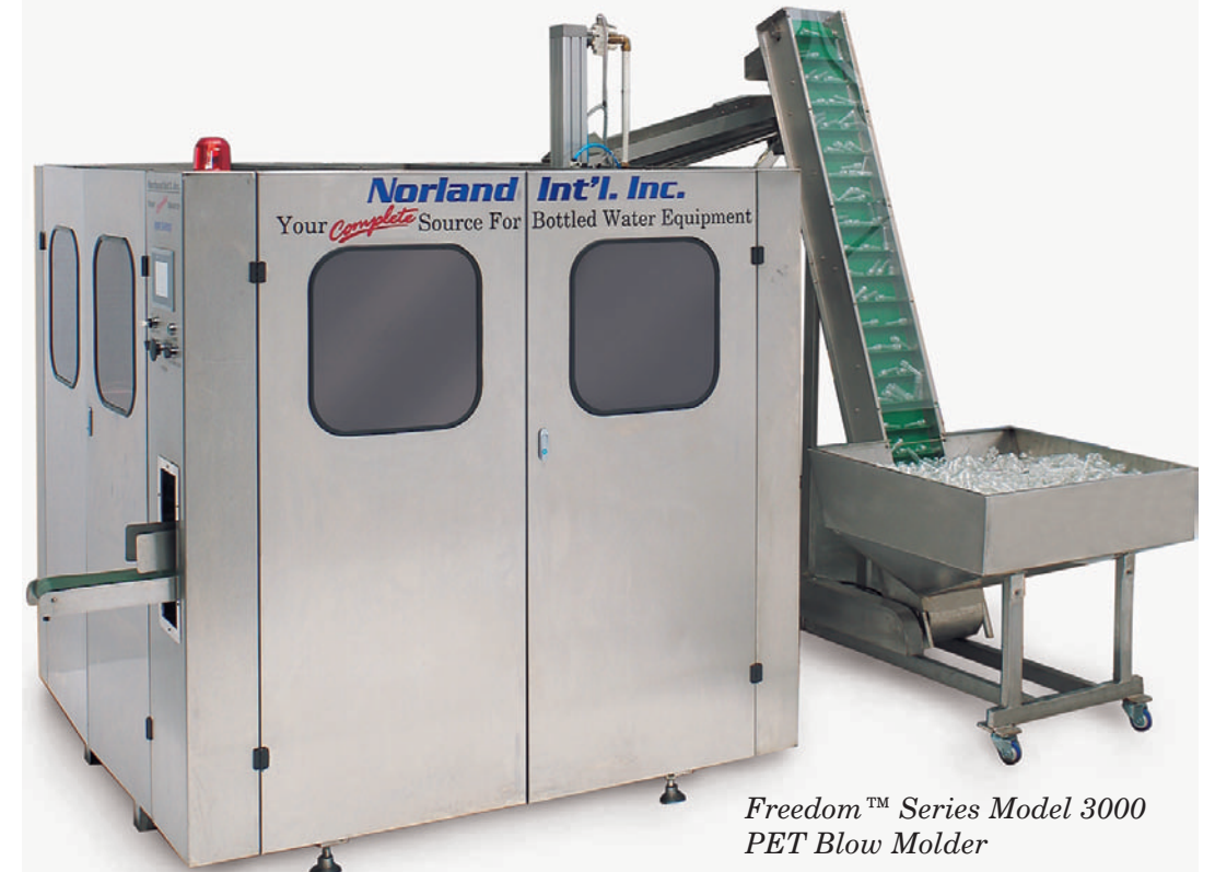
Freedom™ Series Model 3000 PET Blow Molder