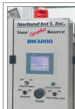
PLC touch-screen controls make start-up and monitoring job status easy.