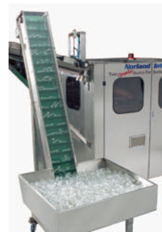
1. Hopper filled with preforms. Gravity-fed elevator platform moves preforms up to