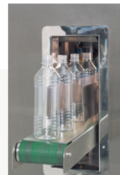
8. Bottles exit the blow molder.