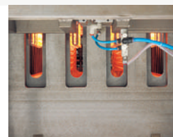
4. Preforms move through four parallel heat tunnels, each with eight heat zones and two quartz heaters.