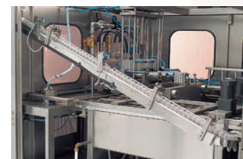
3. Preforms move down the chute from the sorter to be loaded onto the preform holders for transport to heat tunnels. Preform chute includes sensors to verify proper feed status.