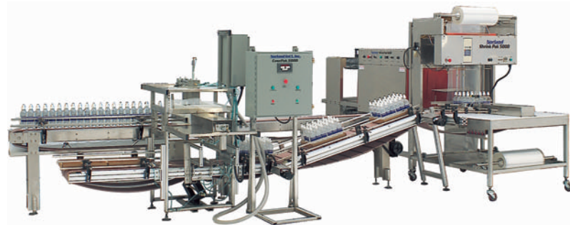
CasePak™ / ShrinkPak™ Packaging System