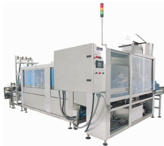
TritonLine™ Automatic Large-bottle Washers / Fillers / Cappers

Call Norland today for more information at (402) 441-3737; or e-mail us at bk@norlandintl.com . Or visit us on the web at www.norlandintl.com