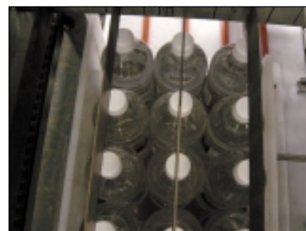
Bottle support knives ensure proper alignment