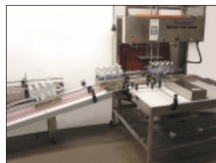
Bottles entering Norland's Shrink-Pak™ 5000 from CasePak 5000's optional lift conveyor for automatic wrapping