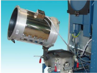
Tiltable tank for easy cleaning