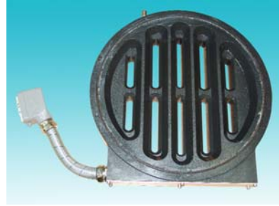
Quick-disconnect grid plate for easy access to reservoir