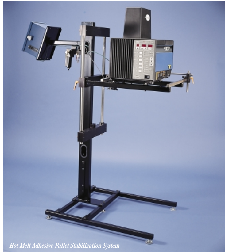
Hot Melt Adhesive Pallet Stabilization System

Versatile systems offer the right system solution for your production.