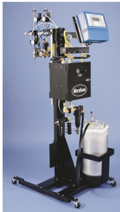
Cold Adhesive Pallet Stabilization System

Cold adhesive bead and spray guns provide integrated adjustment for accurate adhesive volume control.