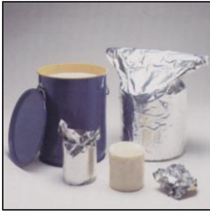
The MC systems can handle and process PUR adhesives in all major standard sizes and packaging.