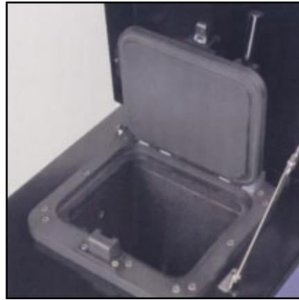
The unique pressurized inert gas lid design protects adhesive from moisture to prevent premature curing.