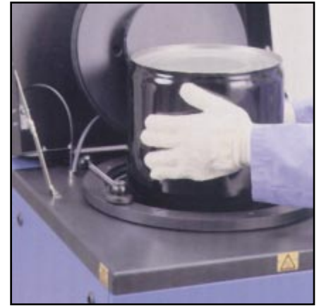
The operator adds a 20-liter (5-gallon) metal pail to the hopper of an MC 4420. The unit continues to pump adhesive from the lower reservoir during pail changes.