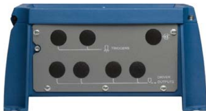
Terminal block version