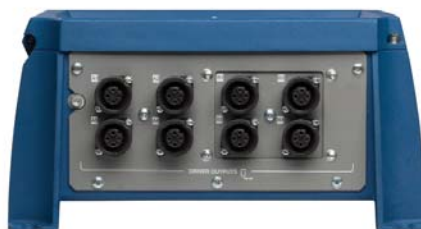
External connector version