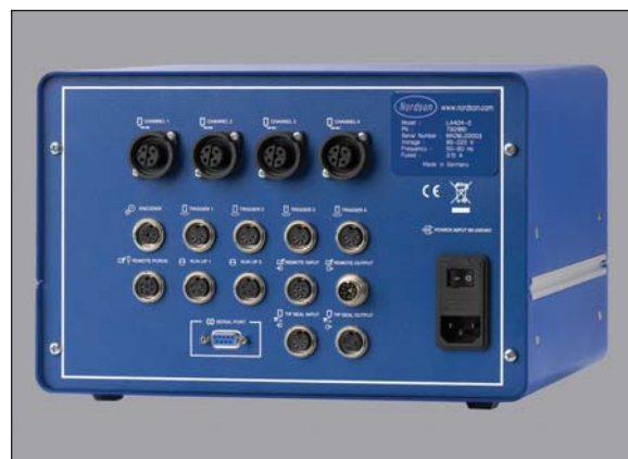
Quick connect cable connections permit easy installation.