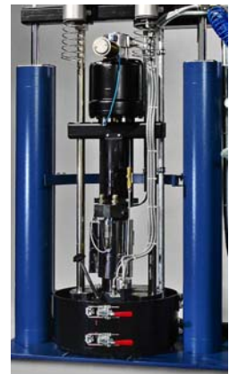
Piston pump unit - the solution for high viscosity adhesives.