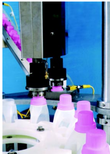
Close-up of capping area

The combination of the multi-position indexing starwheel and tandem head is a solid machine platform to integrate and perform other sequential packaging processes, such as plugging, overcapping, labeling and inspecting. Contact New England Machinery for further details.