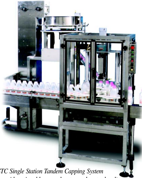
NESSTC Single Station Tandem Capping System (shown with optional hopper elevator and sorter bowl)

The New England Machinery Model NESSTC Single Station Tandem Capper is a complete capping system which includes the cap bulk supply, cap orienting and delivery, cap placement and tightening, and container ingress, staging and discharge onto the customer-supplied existing conveyor.