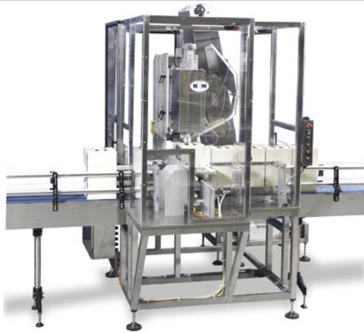
Model NESHC Single Head Capping System (index shuttles)