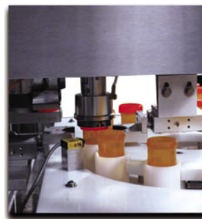
Close-up of capping area