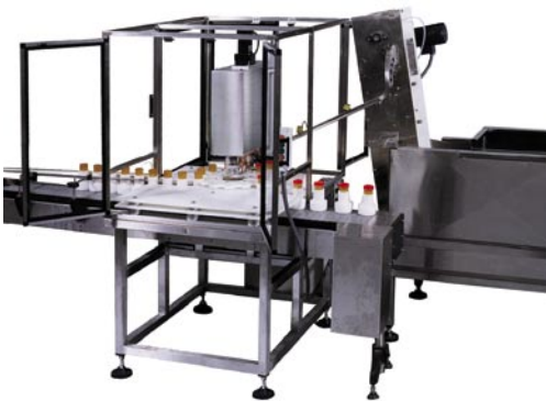
NESHC Single Head Capping System (starwheel)