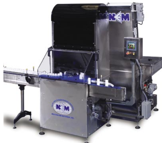
Single Head Capping System with optional servo head

Versatility – The NESHC is a freestanding unit capable of being placed over an existing customer-supplied continuous motion conveyor. This capper offers tool-less, easy changeover modular change parts. Child resistant cap features are available.