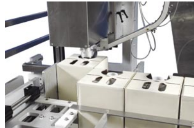
Close-up of capping area

The New England Machinery, Inc. NESHC is a continuous motion single head capping system with a highly accurate indexing turret. Its unique design allows for use with a wide variety of caps and containers. The NESHC's highly accurate cap placement offers positive chuck cap application for straight and secure caps.