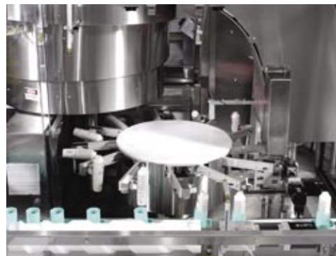
Close-up of rotary beltless unscrambling area and optional integrated pucking system