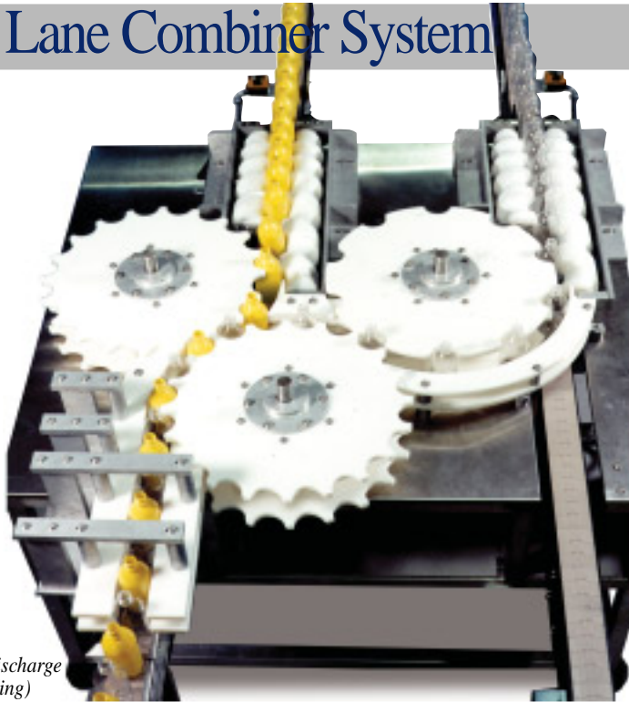
NELC with parallel discharge (Shown without guarding)

The Model NELC includes three distinct sections - dual lane container infeed, lane combining, and single lane discharge.