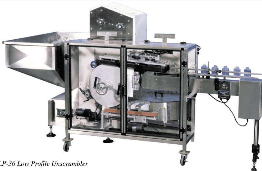
LP-36 Low Profile Unscrambler

Versatility - This low profile design is ideal for pharmaceutical, nutraceutical, personal care products and hospitality style amenities. Designed to handle containers up to 3" in diameter and 6" high, this system is ideally suited for unscrambling small, delicate straight-walled, round, oval and square containers. This affordable system requires minimal floor space.