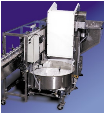
Side view of the bowl

Versatility - This low profile design is ideal for pharmaceutical, nutraceutical, personal care products and hospitality style amenities. Designed to handle containers up to 3" in diameter and 6" high, this system is ideally suited for unscrambling small, delicate straight-walled, round, oval and square containers. This affordable system requires minimal floor space.