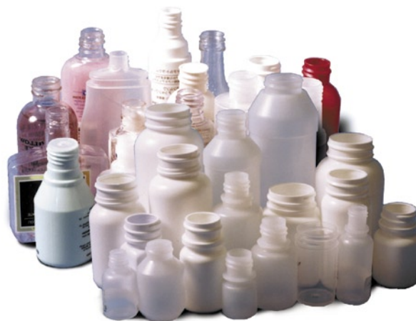
Handles most container configurations