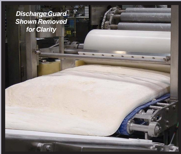
Dough Sheet Exiting the Yoga