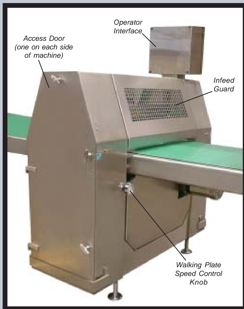
Vertical Stamping Unit