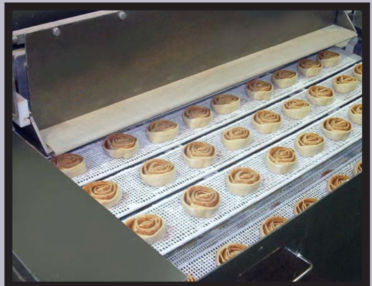
Cinnamon Rolls Loaded on Proofer Trays