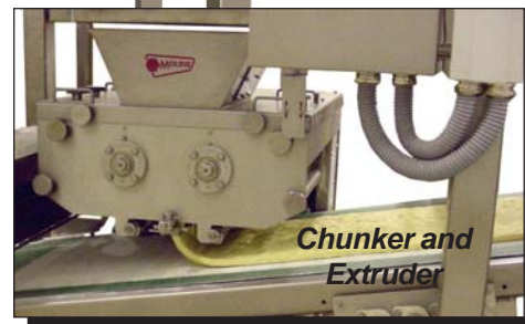
Chunker and Extruder

Packaging - Processing Bid on Equipment 1-847-683-7720 www.bid-on-equipment.com