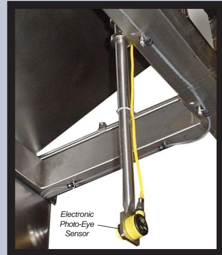
Dough Sensors on Chunker Frame