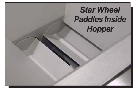
Star Wheel Paddles Inside Hopper