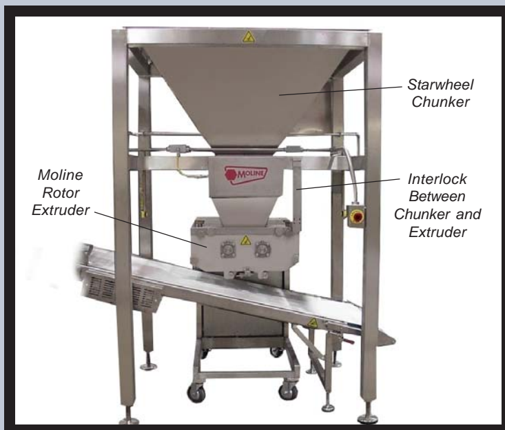
Starwheel Chunker with Rotor Extruder