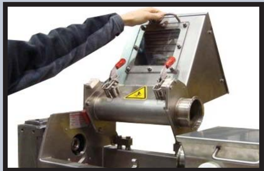
Rotating the Intake Hopper