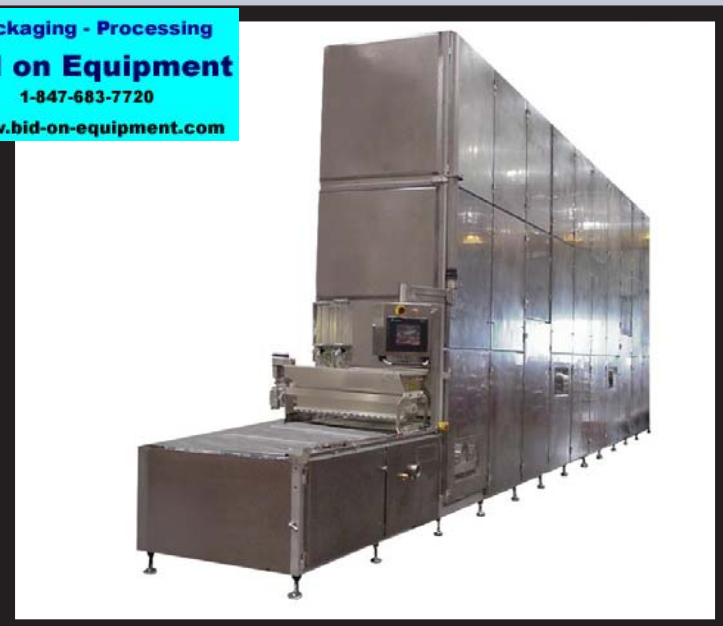
DT10-10R Proofer Without Pass-Thru Module

Packaging - Processing Bid on Equipment 1-847-683-7720 www.bid-on-equipment.com