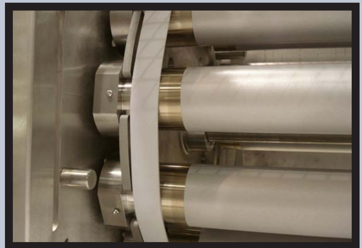
3.5" Diameter Rollers on the Upper Multi-Roll