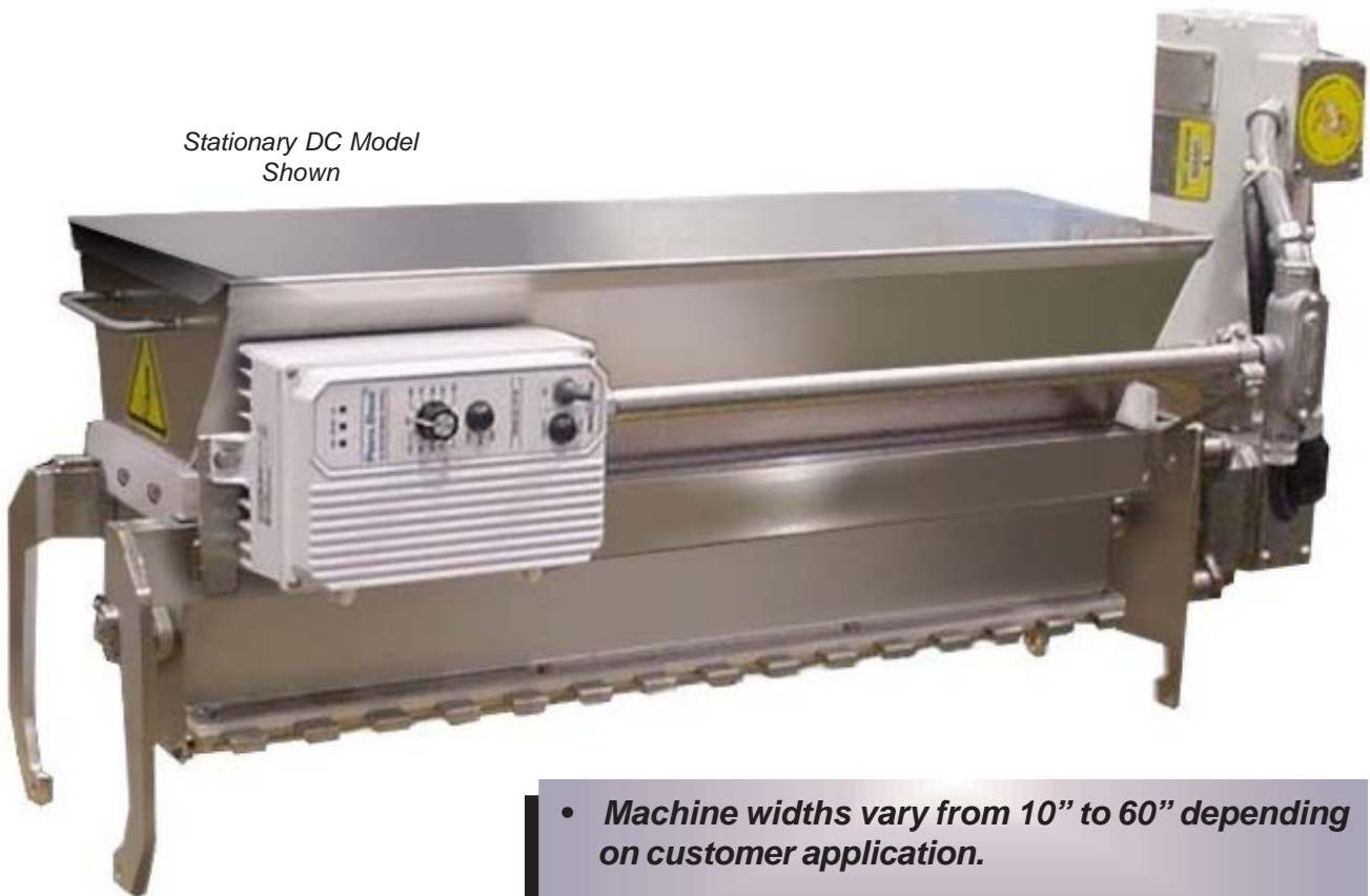
Stationary DC Model Shown

The amount of flour dispensed and the width of the dispensing pattern are adjustable. A variable speed direct drive controls the dispersion rate, while flow adjustment slides in the bottom of the hopper control the dispensing pattern.