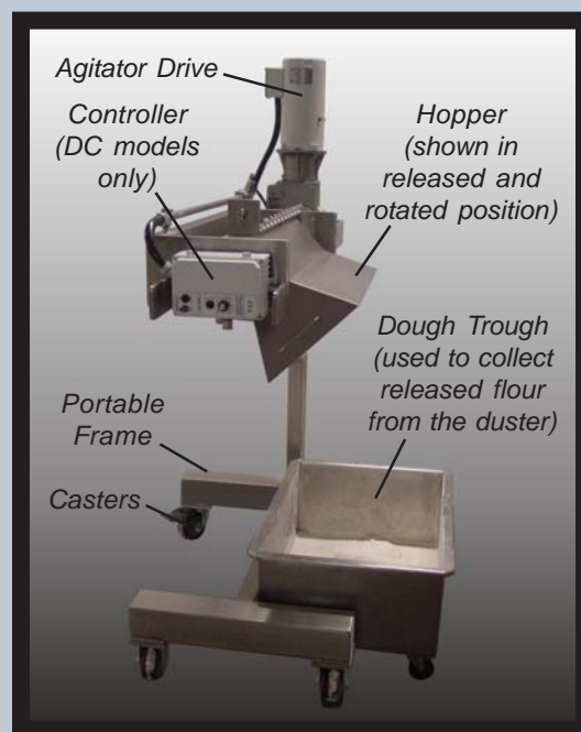
Portable DC Duster/Dispenser (with Quick Release Hopper shown in released and rotated position)