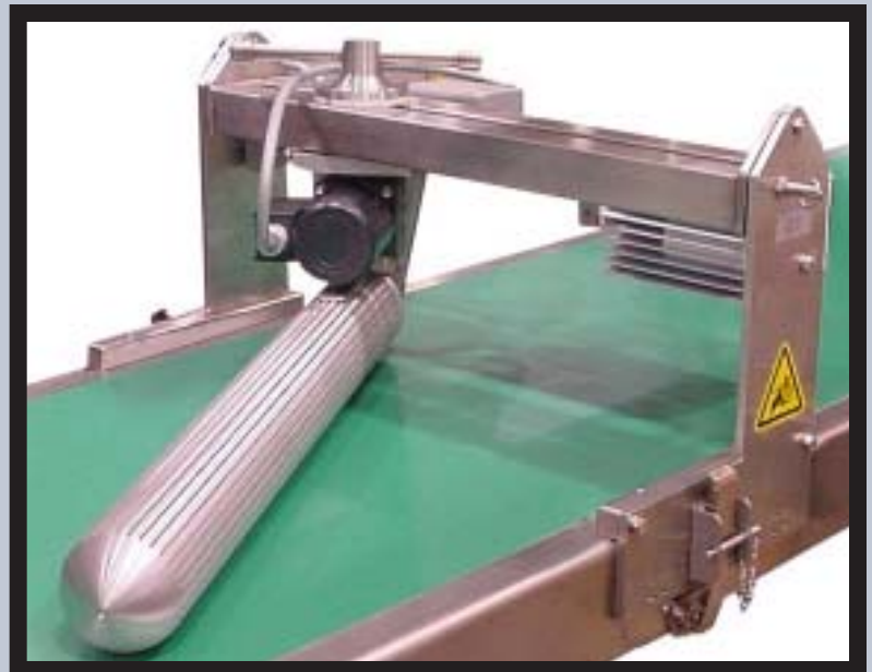
Straight Curling Roll

The straight curling roll (shown below) is nearly identical to the tapered style but contains a straight roller rather than the tapered style.