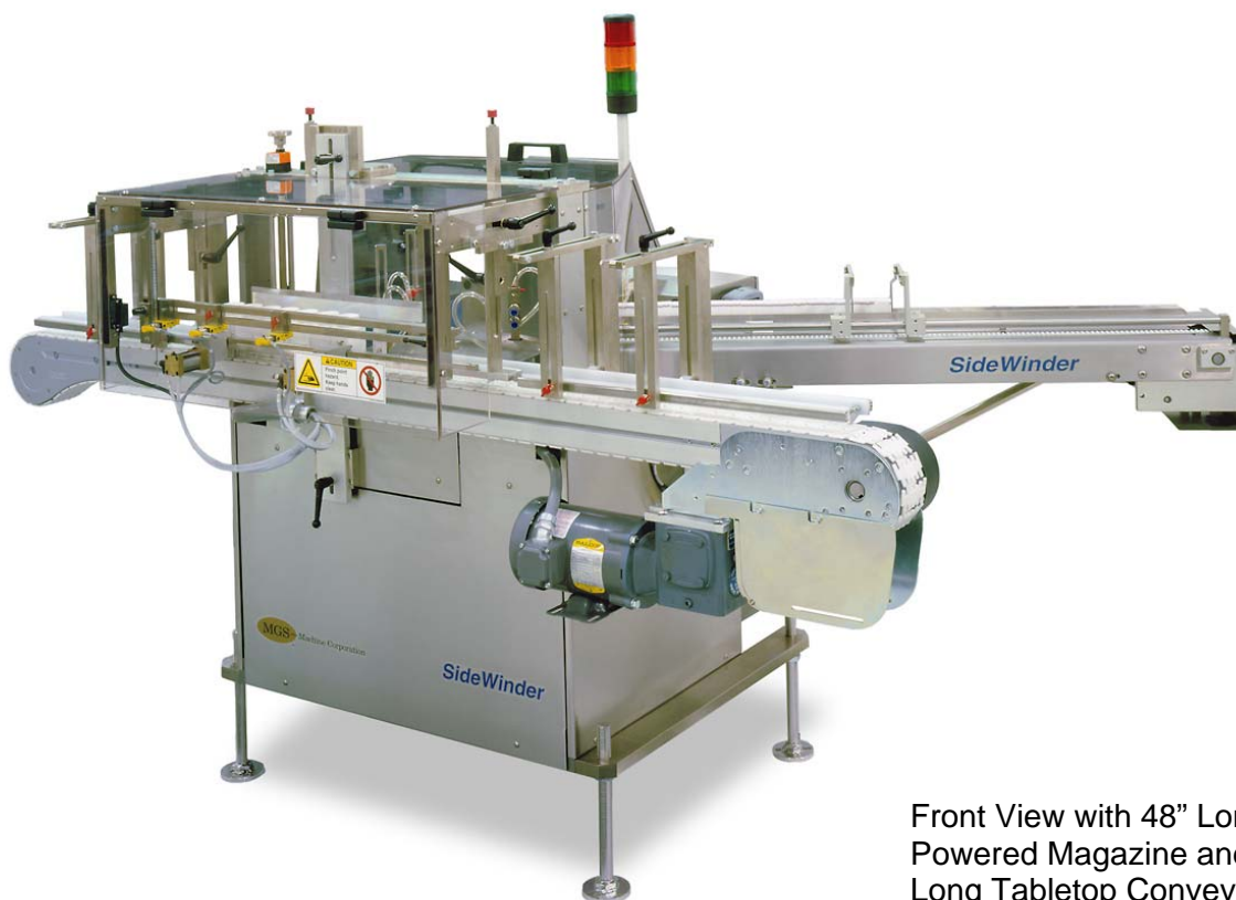
Front View with 48" Long Powered Magazine and 8' Long Tabletop Conveyor