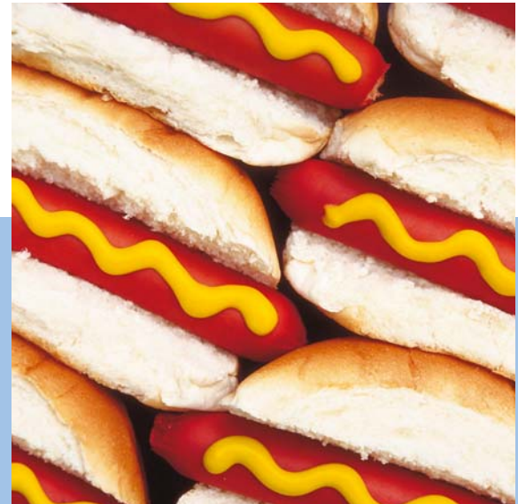
Transfer of mustard and other viscous products.