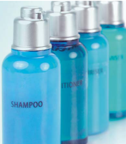
Proportional blending of liquid ingredients.