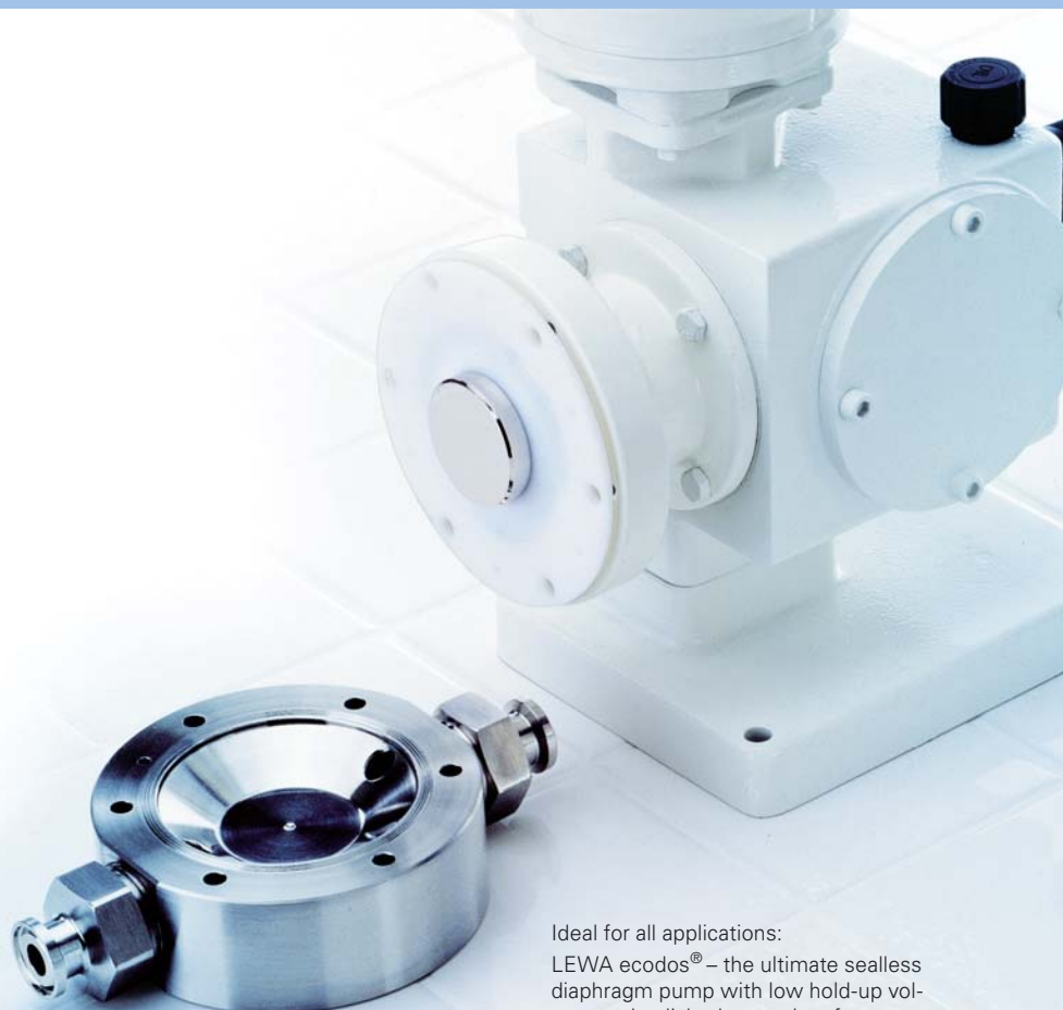
Ideal for all applications: LEWA ecodos® – the ultimate sealless diaphragm pump with low hold-up volume and polished wetted surfaces.

LEWA diaphragm pumping technology makes it possible to handle shear-sensitive and expensive ingredients in a hermetically sealed pumping environment and with gentle pumping action. Due to the extreme low hold-up volume in the pump head and the pressure-stiff characteristics of diaphragm pumps, fluids pass through the pump head quickly and without inefficient slippage.