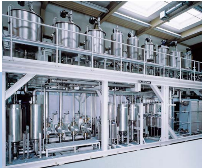
Complex systems for proportional blending or transfer of multiple product streams