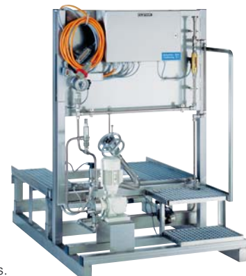
LEWA pumps have many configurations that run the range from simple metering to skids for introducing micro-ingredients.

Extensive documentation is a matter of course at LEWA. Included with the operating manuals are technical data sheets, cross-sectional drawings, material traceability and wear and spare parts lists. Test reports, pressure tests and output diagrams are available as options.