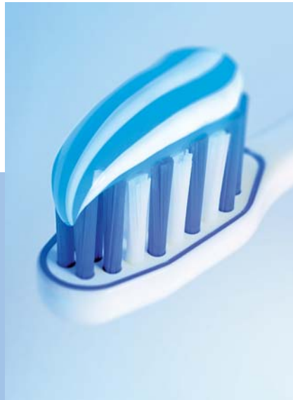
Metering of colours, flavours, or preservatives.