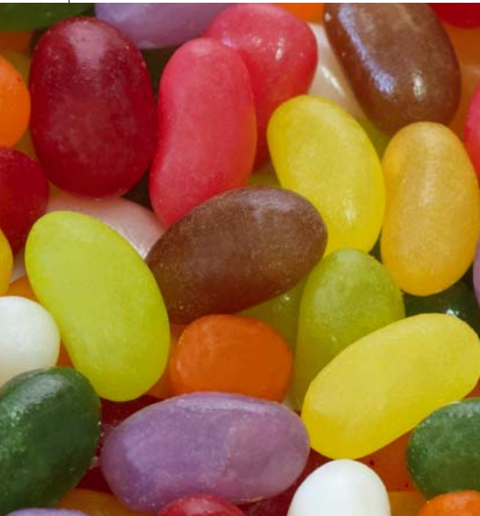
One pump for many applications: Production of jellied sweets.