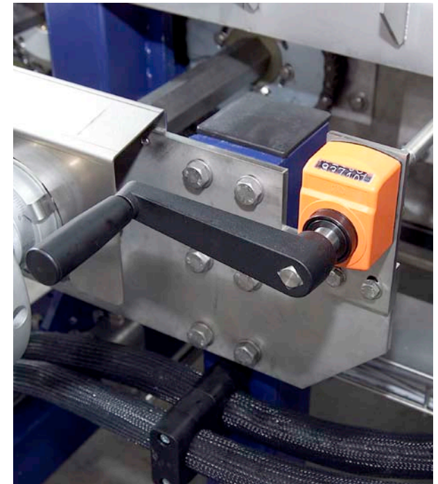
Crank for infinite adjustments