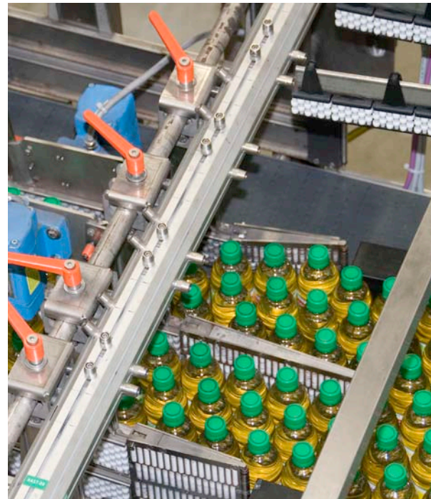
Variable lanes at machine infeed

To be able to transport also soft or light-weight containers as gently as possible, each conveyor lane can be equipped with its own drive including a separate back-up pressure controller.