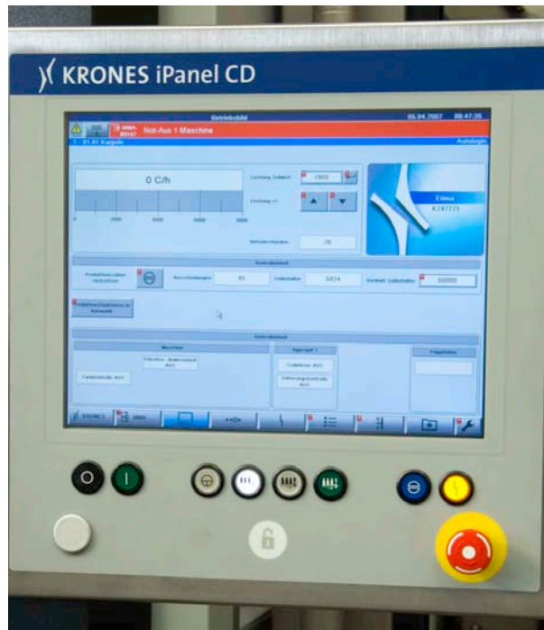
Easy touch-screen operation