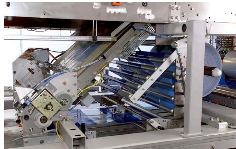
Film cutting module

Using an automatic film splicing unit, film reels can be changed "on-the-fly" during operation.