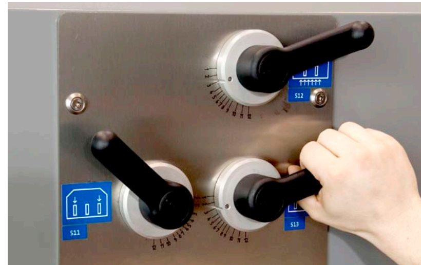
Easy adjustment of the air nozzles