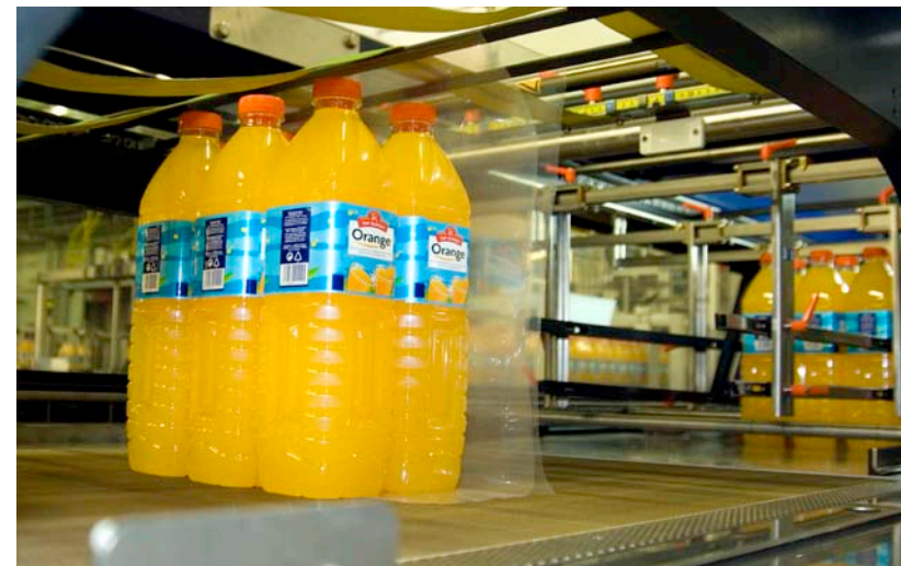
Film wrapping module