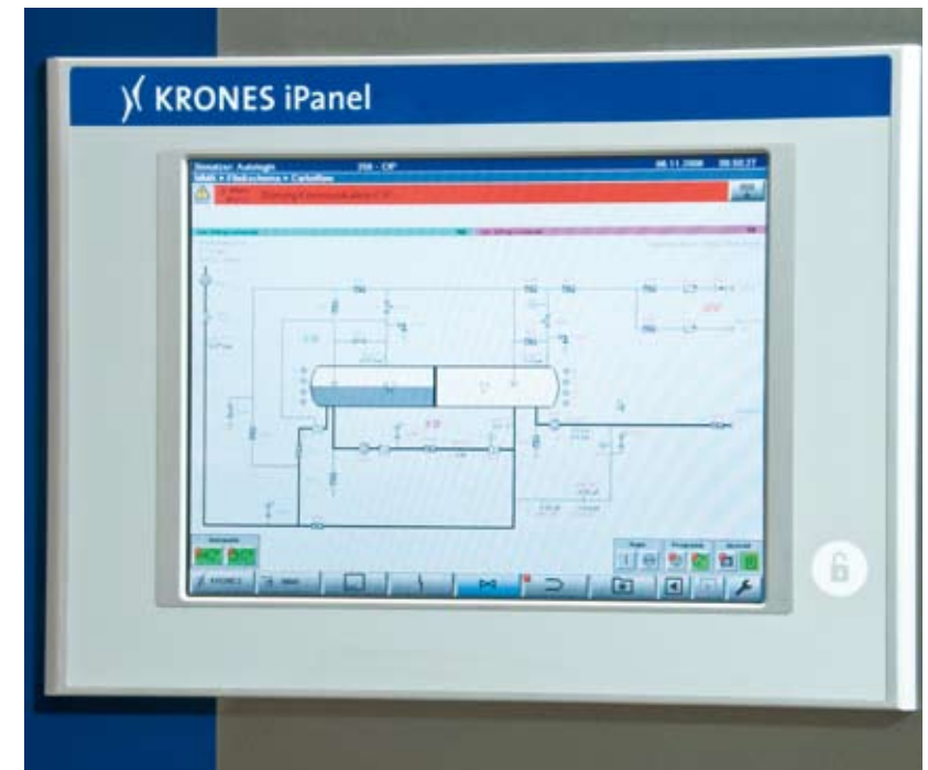
Touch-screen with interactive flow diagram