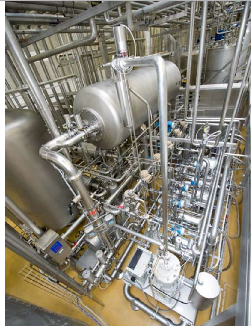
Six-component mixer with dry running vacuum pump