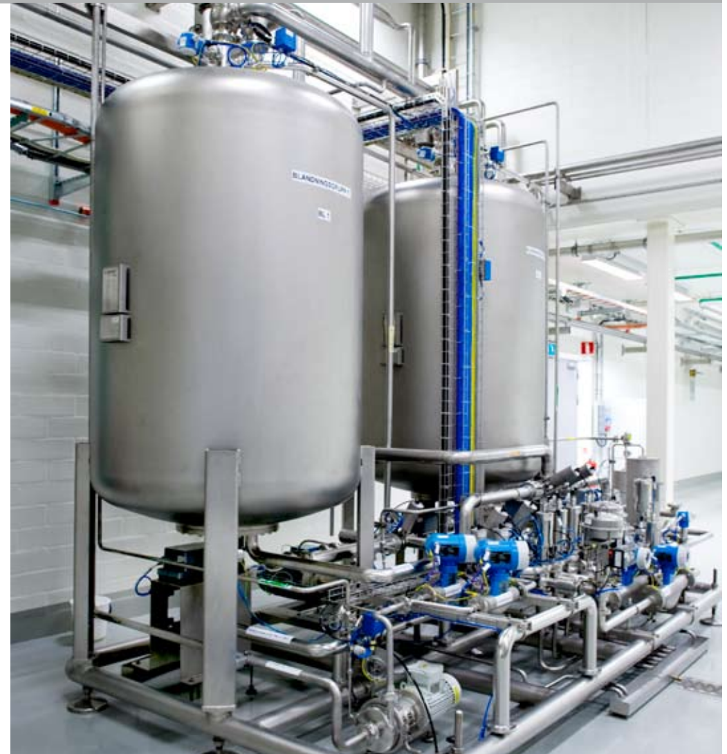
Multiblend MF 24/12

Flexibility is everything: The fast and individual mixing of finished syrup is a key factor in the successful production of numerous flavours. Multi-blend transforms syrup production into an automatic system that manufactures all types of syrup with the highest precision. The syrup is prepared in batch mode, i.e. the starter syrup for the next production step is manufactured in the two-component mixer.