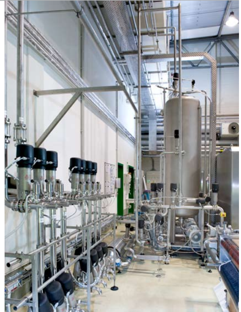
Multiblend with component dosing