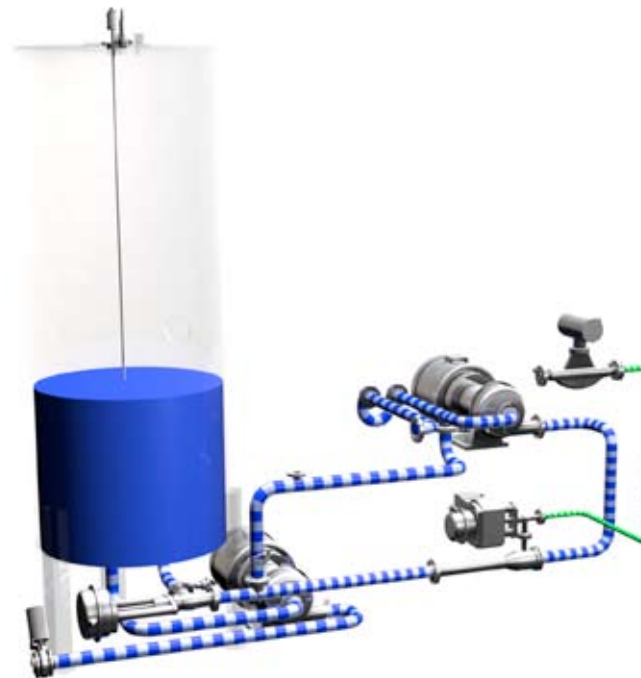
Circulating carbonation for adapting the performance with no gas consumption

Using the circulating carbonation system it is possible to reduce the mixer performance to 33 %. This is done in accordance with the level in the carbonation tank. A very low level of gas consumption in the carbonation tank is achieved as the result. Up to two gaseous components can be dosed. The technological values such as brix, CO 2 dosing accuracy and degassing remain constant in spite of the adjusted performance level. The mixer stops working only when the receiving machine (filler or flash pasteuriser) stops completely for a prolonged period.