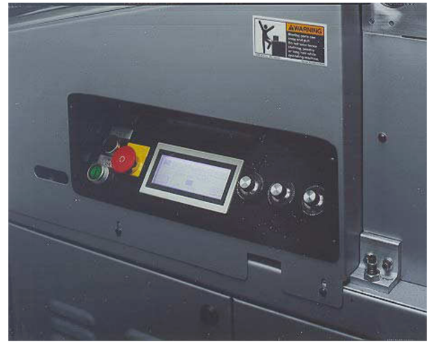
A straightforward operator interface simplifies operator training and setup