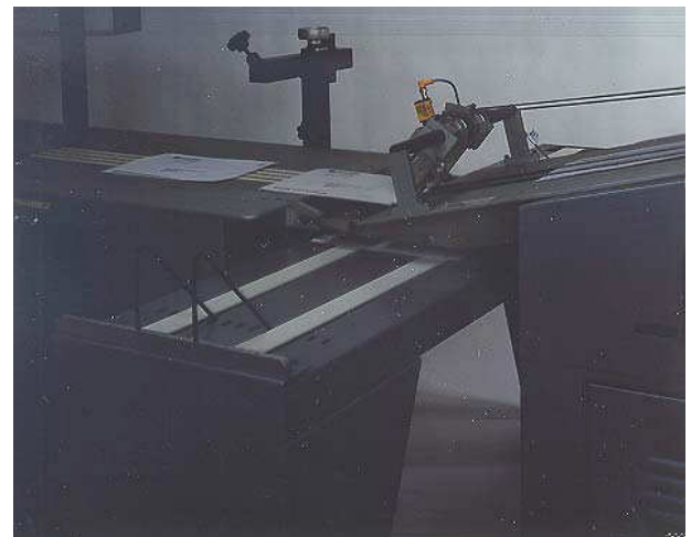
Minimal set-up time is needed because the KR 630 rolls into position over-top the shingle conveyor.

Specifications subject to change without notification Guards have been removed for clarity. Do not operate machine without guards in place.