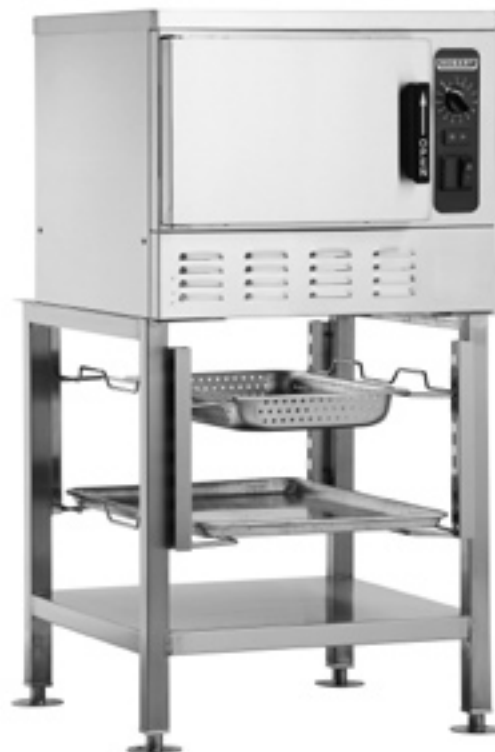
Shown on optional stand with extra set of pan slides and pans