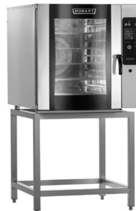
CG10FI Shown with optional stand