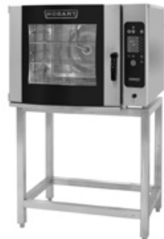
CE6HD Shown with optional stand