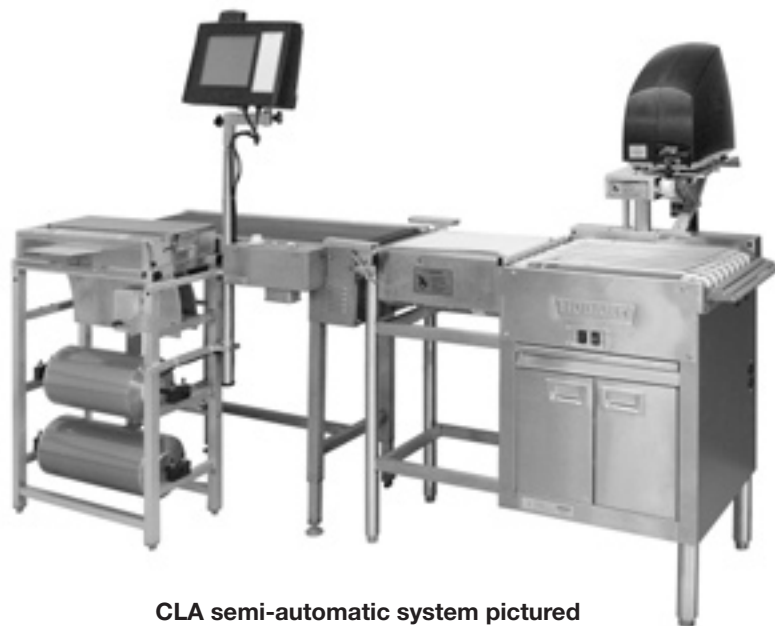
CLA semi-automatic system pictured with W32 wrap station, SP-5 sealer belt, CLA indexer, and Access scale and printer

Reference F-40256 for CLA components and accessories