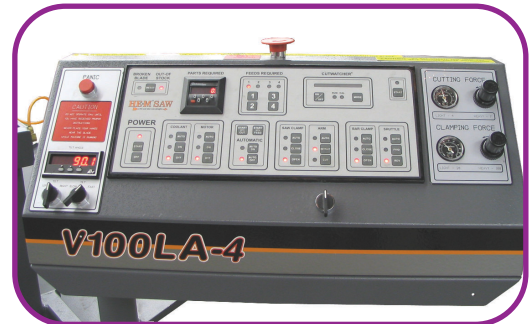
Saw Shown with Optional Second Main Machine Vise