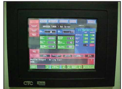
User-friendly touch screen. Controls allow for remote diagnostics.

(Dimensions shown are approximate and subject to change; consult factory for exact figures.)