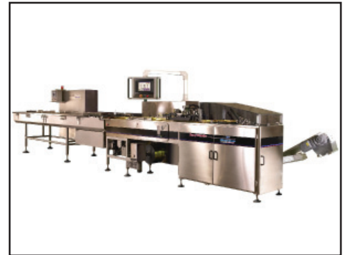
HayssenSandiacre offers infeeds to the RT for a fully integrated packaging solution

Let us customize the RT2000 to meet your specific requirements. Whether it is a specific package style or a production need, the RT2000 is a proven high speed performer. We also offer high speed infeeds for an integrated packaging solution. The RT2000 offers easy interface to many 3rd party feed systems.