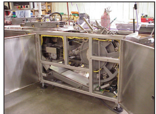
Open Access Front and Rear Frame