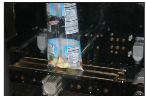
Continuous Motion Reciprocating Jaw