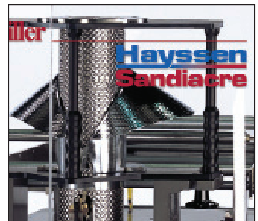
Simple and fast bag size changeover with one-piece forming sets.