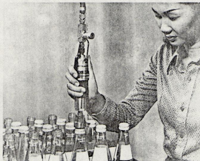
Uncapping a case of returnable bottles with an HCH-18L before washing at a soft drink plant.