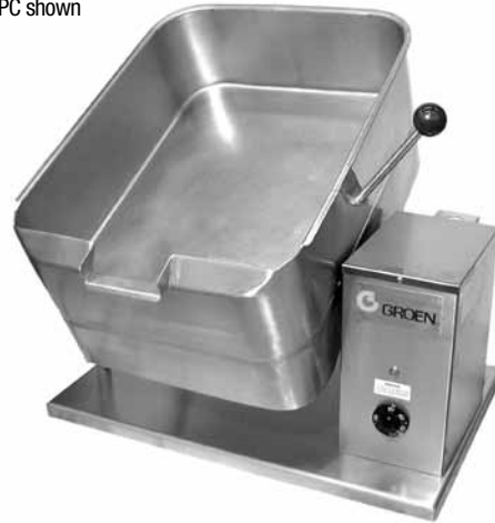
Model TD/FPC shown

Unit to be thermostatically controlled to automatically shut off when desired temperature is reached and to turn on when product temperature falls below desired setting. Unit to have Hi Limit thermostat as safety feature.