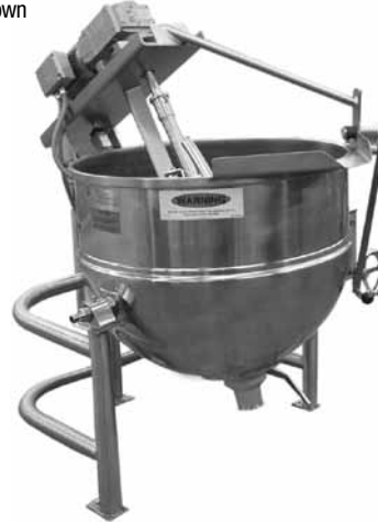
Model DL-60, INA/2 shown

Bottom outlet to be 2" flush-mounted, sanitary quick opening ball valve.