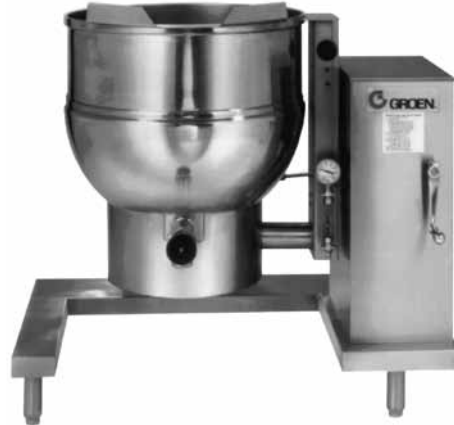
Model DEE/4T shown with optional 2" tangent draw-off

Controls shall include a thermostat, built-in contactor, safety tilt cut-off, safety valve, pressure gauge, water sight glass, heat indicator light and low water cutoff.