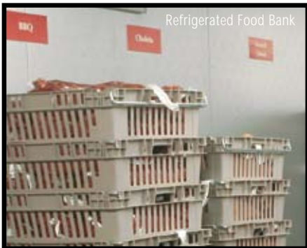
Refrigerated Food Bank