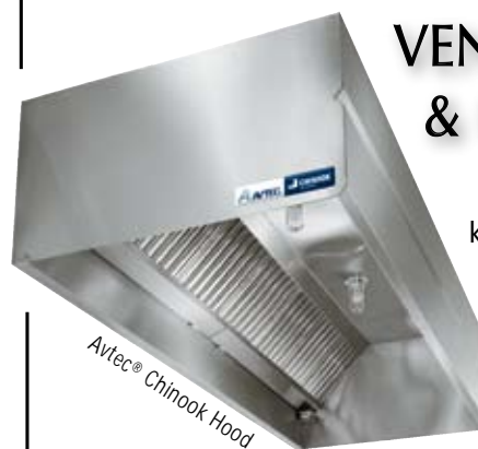
Avtec® Chinook Hood