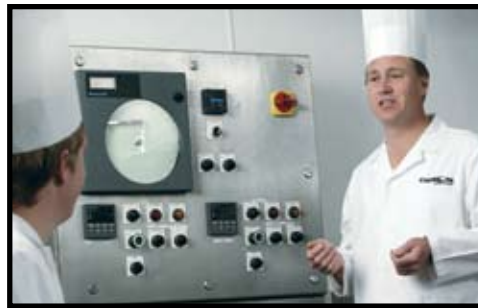
Kettle control panel training