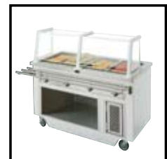
Randell RanServe hot food tables have integral heaters and are NSF listed