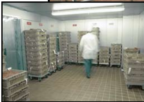
Refrigerated food bank for storage up to 45 days