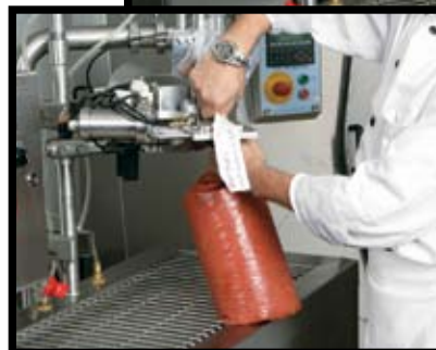
Station-mounted clipper for sealing, attaching label and trimming casing