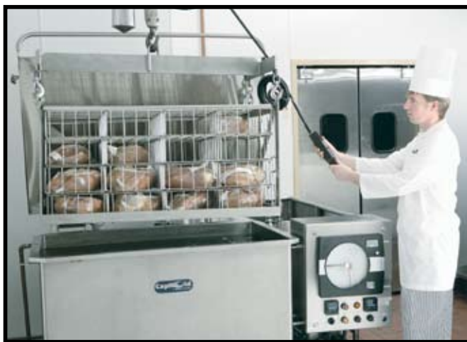
Loading and unloading food product with a push of a button

Water bath slow cooking can be done overnight, unattended. An integral control system monitors both cooking and chilling and provides a time/temperature production record for HACCP and quality assurance.