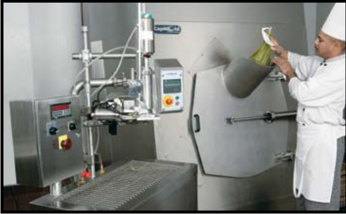
Loading filled casings directly into the tumble chiller