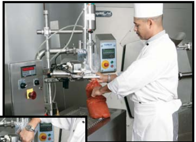
Transferring kettle foods to flexible plastic casings

At the completion of a cooking cycle, the Pump-fill Station draws product from the kettle, measures a pre-set volume, and fills a flexible plastic casing. The operator uses a station-mounted clipper to seal, attach a label, and trim the casing in one fluid motion. One employee can typically empty and package the entire contents of a 200-gallon (750-liter) kettle in 15-20 minutes. A Pump-fill Station can be shared by two or more kettles.