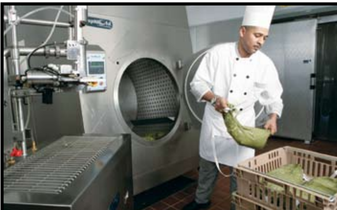
Unloading chilled casings from tumble chiller to food bank storage