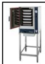
Groen steamers are an excellent way to reheat food in casings or steam pans

CapKold foods are ideal for pre-plating as part of a tray makeup and delivery system. They can be used in combination with freshly prepared foods and foods which have been blast-chilled. Randell offers a line of blast chillers as well as standard and customized hot and cold food tables for serving applications.