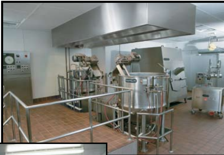
CapKold kitchen (from left to right, shown above) - kettle control panel, (2) kettles, tumble chiller and pump-fill station