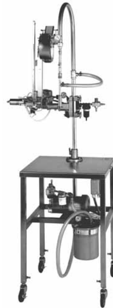
Model CVW Clipper