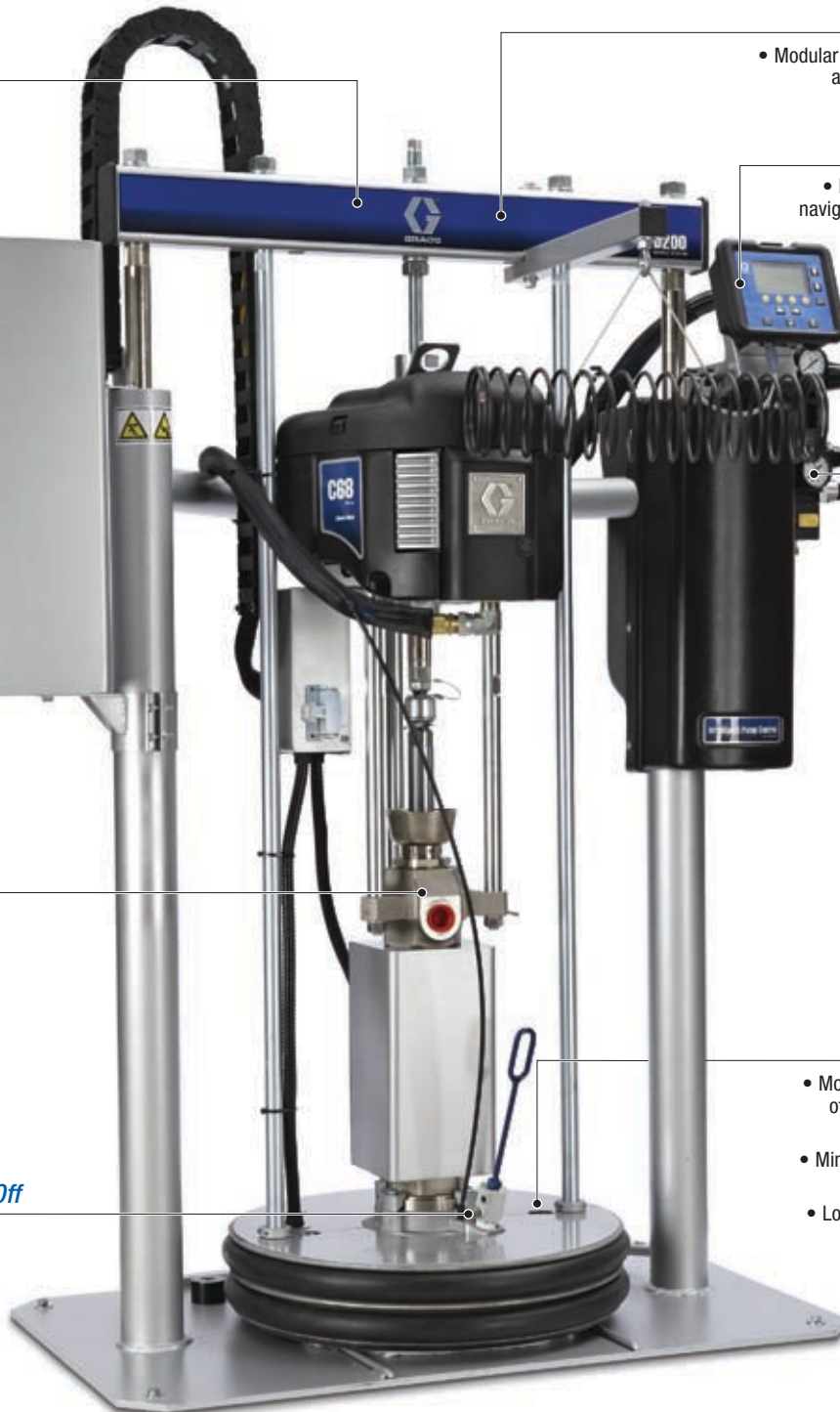
Graco Warm Melt Supply System