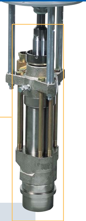
MaxLife Dura-Flo™ 1800