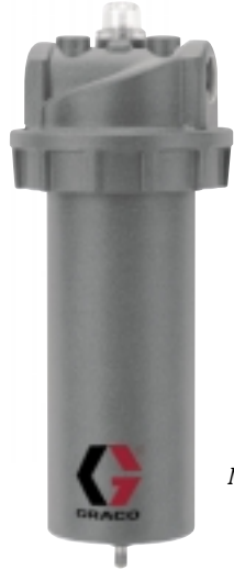
Model Number 234409