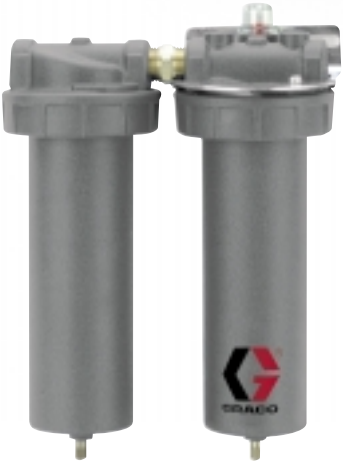
Model Number 234405

Remove Water, Oil & Contaminants from Compressed Air