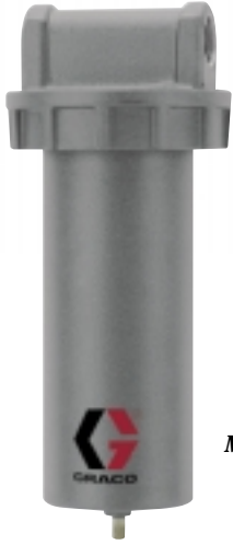
Model Number 234408