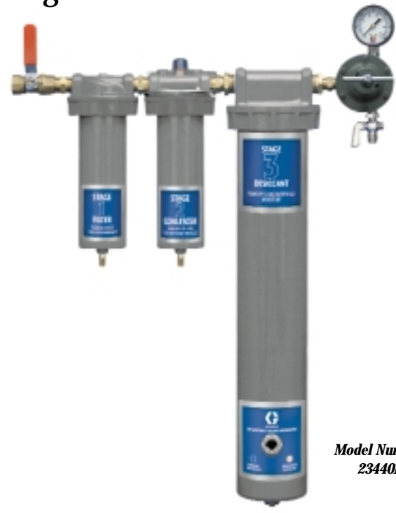
Model Number 234401