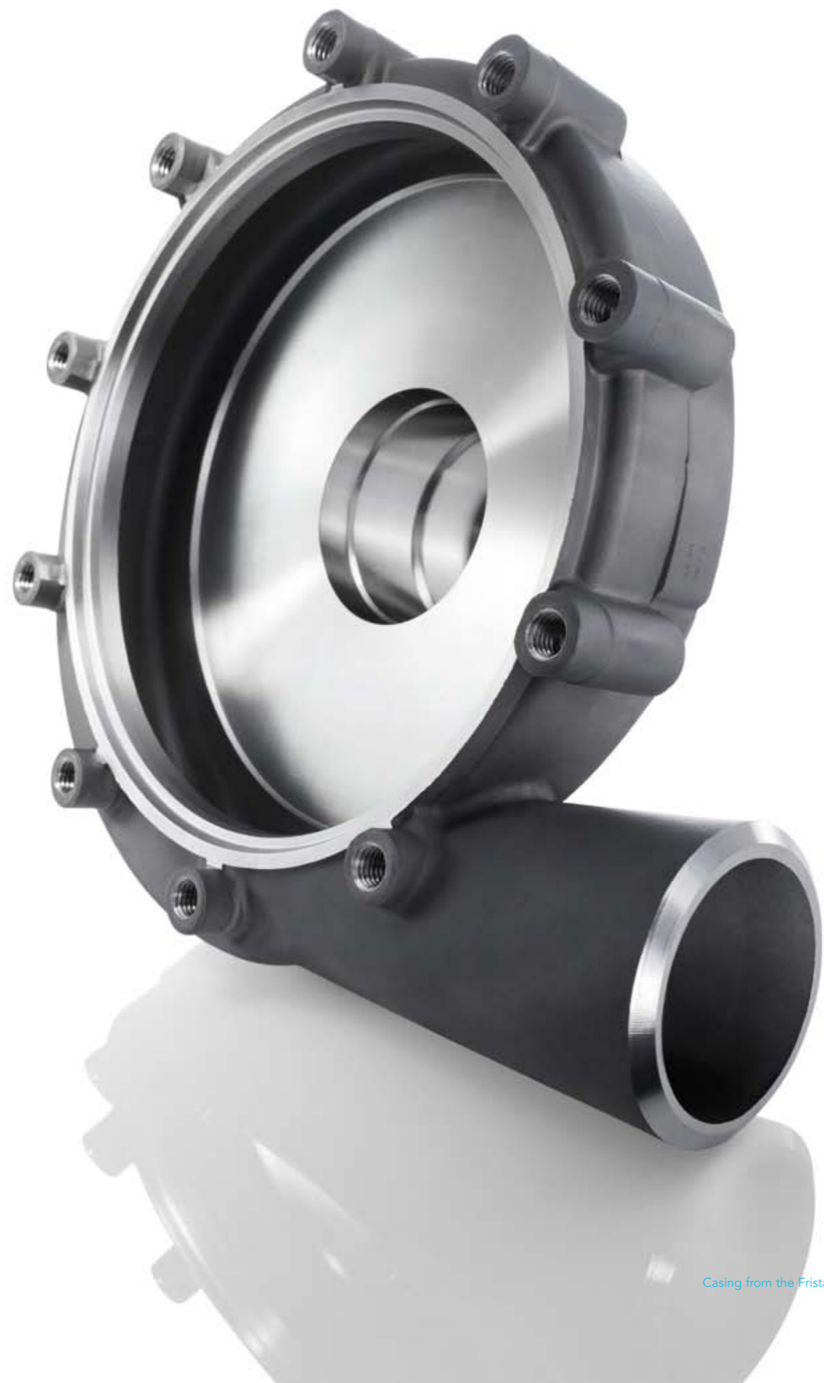
Casing from the Fristam FPH