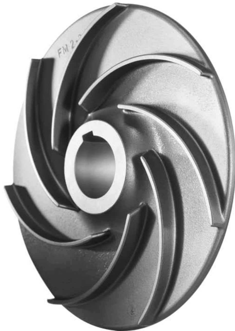
Impeller from the Fristam FM