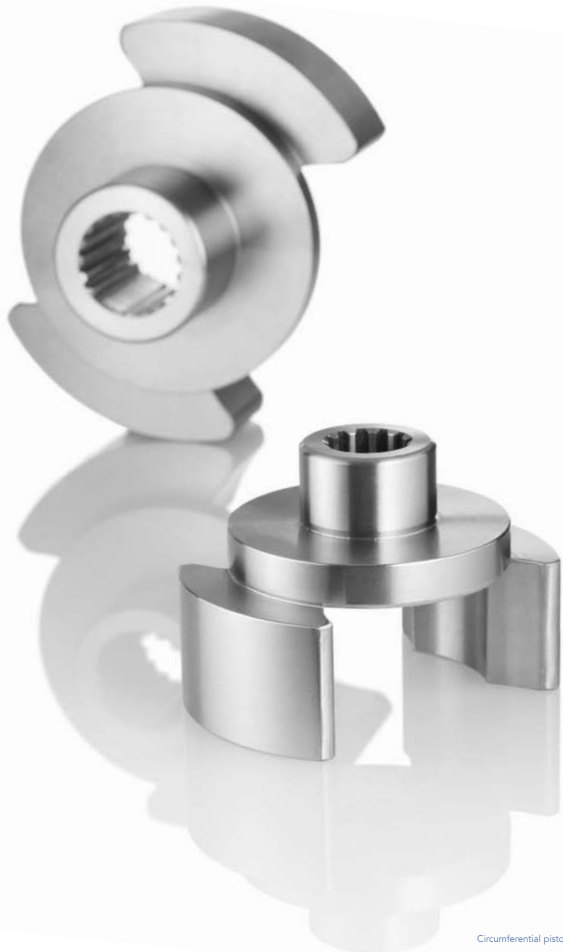
Circumferential pistons from the Fristam FK