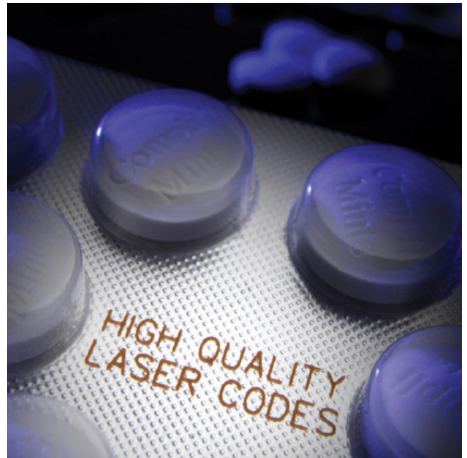
D-Series plus pharma version available