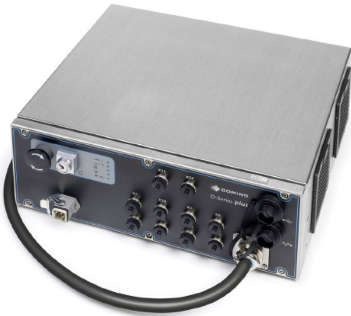
D-Series plus controller offers flexible stand-alone and 19" rack mounting options