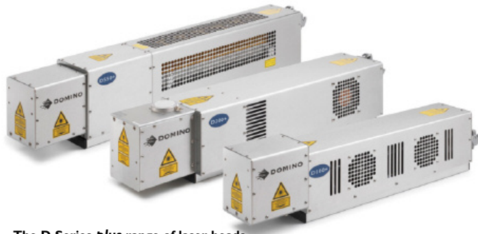
The D-Series plus range of laser heads

The D-Series plus is a highly versatile range of industrial scribing lasers designed to provide high quality codes across a wide range of production speeds. The robust and easy to use D-Series plus offers flexibility whilst maintaining productivity.