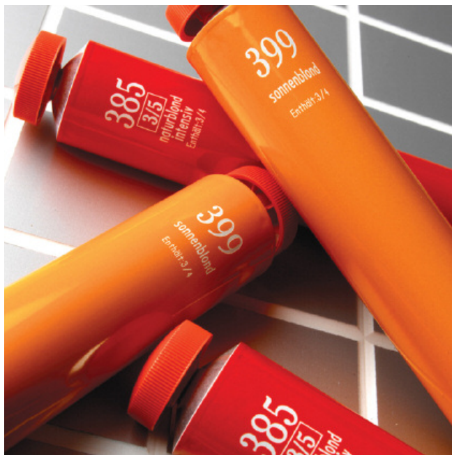
D-Series plus offers various high quality fonts

The D-Series plus range will improve overall equipment effectiveness – maximising uptime with intuitive set-up designed to reduce operator errors, leading to minimum changeover times.