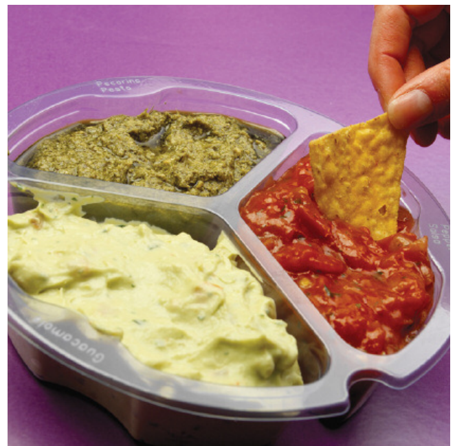
D-Series plus offers a wide marking field