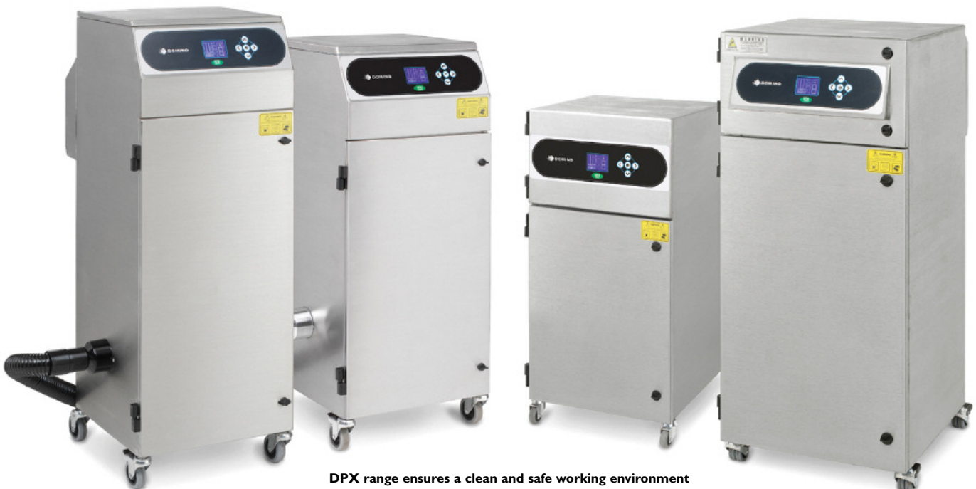
DPX range ensures a clean and safe working environment