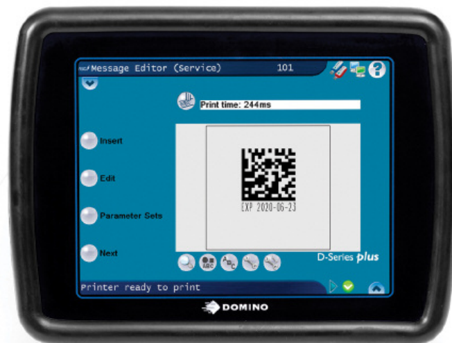
Domimo Touchscreen option with intuitive user interface